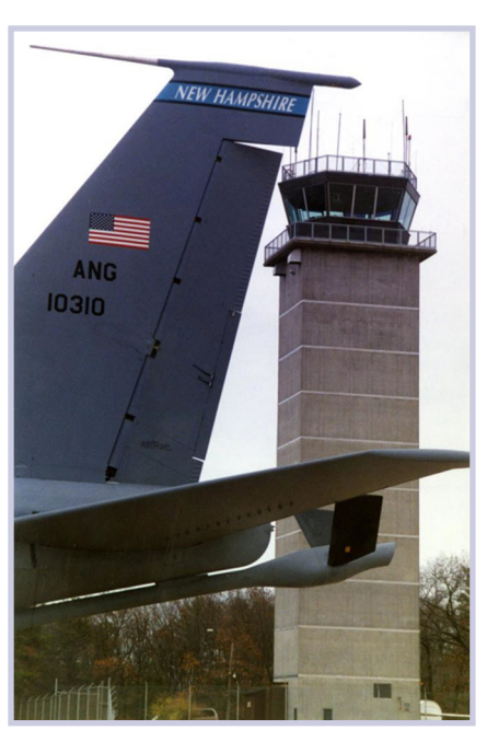
The 260th ATCS stands up at Pease, adding a distinguishing presence to the base and airfield.

On March 1st the 260th Air Traffic Control Squadron officially completed its transition to