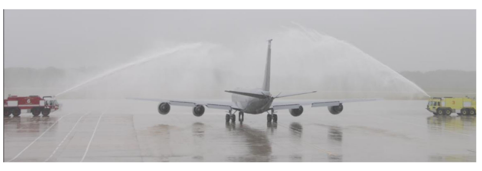
Pease's Fire Department bids farewell to aircraft tail number 58-0008 as it departs the base for the final time.

Later, and unceremoniously, on a cold December 10th, 62-3520 took a one-way trip to "the boneyard" for storage until return to flying status or to be used as spare parts for other aircraft. While the unit's conversion to the Pegasus was just beginning, the retirement of these two aircraft would be a subtle turning point that foreshadowed the changes coming over the next decade.