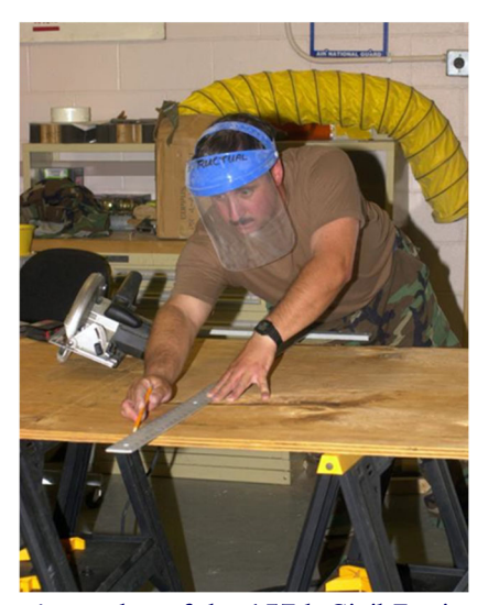
A member of the 157th Civil Engineer Squadron cuts plywood for a project during a deployment for training to Ecuador.

school for a local village. The engineers flew back to Pease at the end of their trip, narrowly avoiding a winter storm moving up the coast.