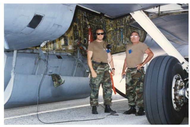
Members of the 157th Maintenance Group work to correct fleetwide deficiencies on a KC-135 Stratotanker.

Within 24-hours of arriving on station all three Pease crews were fully integrated into the task force and flying over Iraq to enforce the no-fly zone as part of the 484th Expeditionary Wing. By the end of the 31-day rotation, New Hampshire's addition to the effort resulted in 54 missions flown with an amazing 2,891,300 pounds of fuel offloaded during 273 combat hours in the air above Iraq.