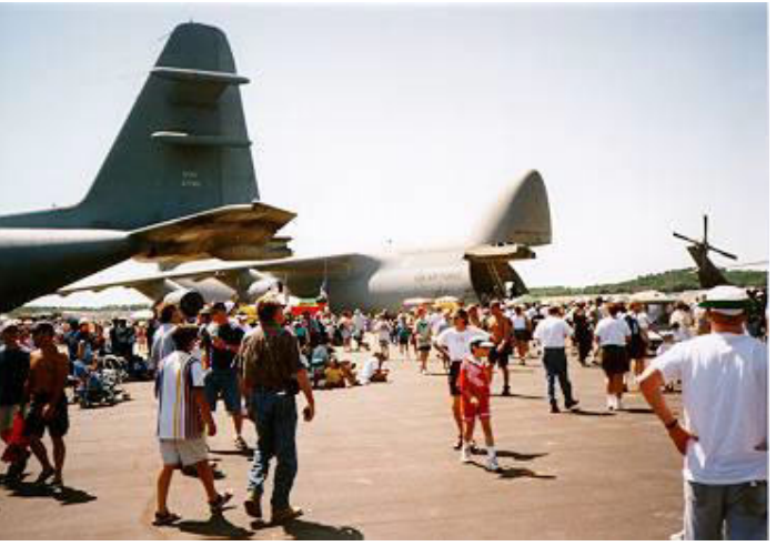
Patrons enjoy a celebration of air power at Westover Air Reserve Base, Mass.