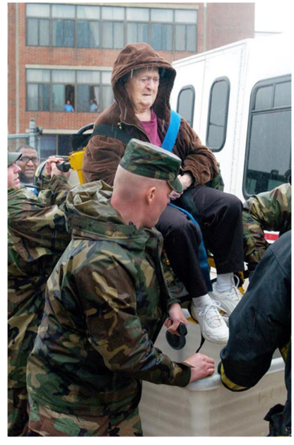
A New Hampshire Air Guardsman helps to evacuate an elderly citizen while responding to a the ice storm.

On а Wednesday night, the forecast was for some rain, changing to freezing rain, and spots of patchy snow. As New Hampshirites woke up Thursday morning, the picture was entirely different. 440,000 homes were without power, making it the largest power outage in