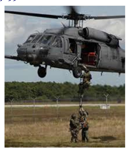
MH-60 Pave Hawk from the N.Y. ANG's 106th Rescue Wing assists in training.

During October's drill, the unit conducted Exercise Global Guardian to test the Wing's preparedness for its nuclear deterrence and survivability missions. The base-wide effort, that tested every function of both operations and support,