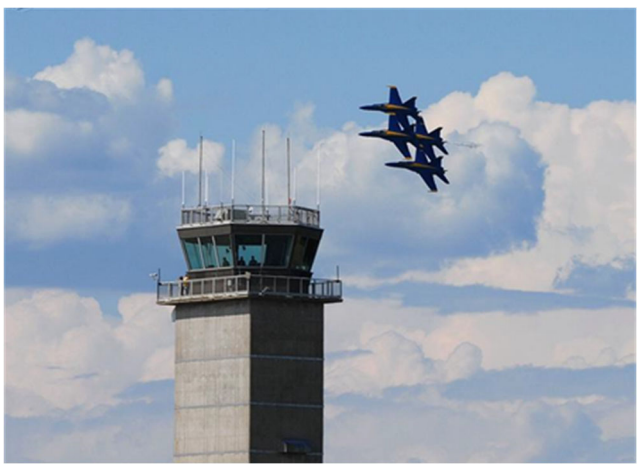
Photos from the Boston-Portsmouth Air Show. above : The Navy's Blue Angels fly past the tower at Pease ANGB in a diamond formation. opposite left : A KC-135 Stratotanker open for tours. opposite top right : A large crowd enjoys the show. opposite bottom right : A young show-goer sits on his father's shoulders to see over the crowds.

Wing won an 11th Air Force Outstanding Unit Award and another Organizational Excellence Award for the Headquarters, New Hampshire Air National Guard.