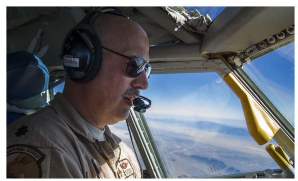
Maj. _____ flies a KC-135 Stratotanker to support operations in the U.S. Central Command's theater of operations.

eling tanker. Pease was selected from among five Air National Guard installations across the country. This selection would pave the way for a long and sustainable future for the Airmen of New Hampshire!