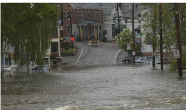
top: Members of N.H.'s Air Guard help place sandbags to waylay rising waters in flood-stricken areas. center: The Mother's Day Floods of 2006 left N.H. communities under water and in need of assistance. bottom: A member of the 157th Security Forces Squadron directs traffic. opposite page: All hands were on deck to fill sandbags and other tasks needed to support relief efforts.