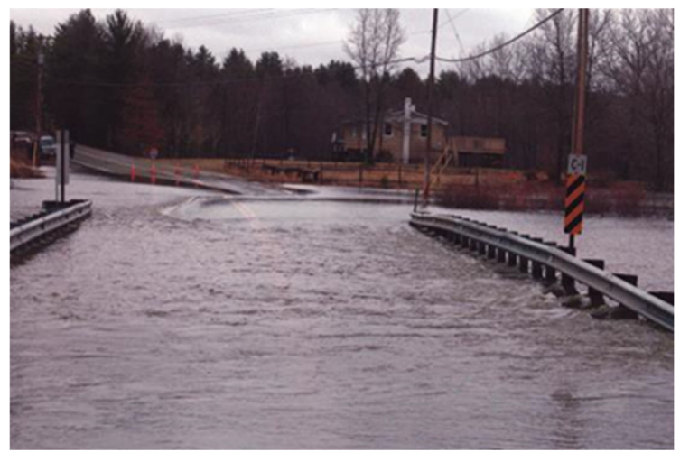
The spring of 2007 brings a sense of déjà vu as floods strike New Hampshire and require Guard assistance in the response and recovery.

During a Nor'easter in April, the New Hampshire National Guard was called upon to assist first responders. From placing sandbags to providing traffic control, more than 200 N.H. citizen soldiers and airmen deployed to more than 16 communities. On the ground, they assisted local police and fire departments to bring reassurance to residents. Gov. John Lynch activated 200 Guardsmen on April 16 and later authorized the call-up of an additional 200. The Air side was tasked with bringing two five-ton military cargo trucks to the flooded Nottingham Elementary School where 18