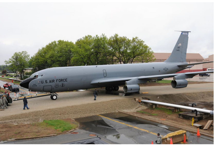
each unit's advanced teams for The last of the KC-135E-model aircraft is towed to its place of honor to

Prior to 2008, the plan for the eight KC-135E's parked on the ramp in 2006 was to store them for up to one year, with the hope that the aircraft would be transferred to Davis-Monthan Air Force Base, Arizona, sometime in that year. The original plan was to wait for either Congress to find the funding to convert the E-Models into R-Models or allow the Air Force's total tanker strength to dip below 500 and retire the aircraft. A third, unforeseen ending, occurred in summer of 2008, when the realization that mothballing all the KC-135E's caused no Air Force pilots to be qualified to fly them, and in six months there would be aircraft on the ramp with no pilot in the force to move them. To avoid that logistical nightmare, the Air Force approved the E-Models to move from Pease to the storage area at Davis-Monthan, aka the bonevard. The eight temporary technicians hired for the purpose of keeping them maintained to a no-fly status would