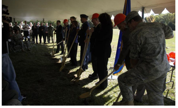
Leadership and engineers break ground at the site of Building 100.

The eighth E-Model, bearing tail number 57-1455, unknowingly had its final flight when it arrived at Pease last year,