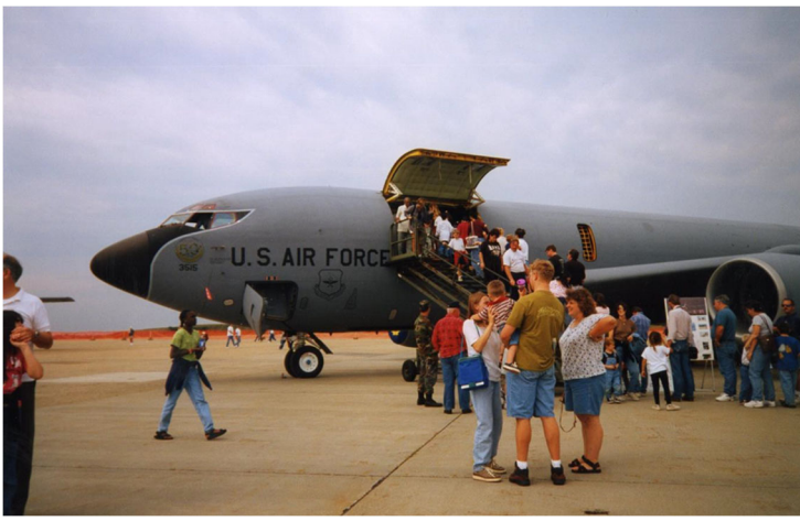
A small sample of the 100,000 visitors to the 2000 Wings of Hope Air Show wait in line to tour A KC-135R Stratotanker.

Throughout the Kosovo conflict and the stabilizing efforts in Bosnia and Herzegovina, NATO's peacekeeping forces required constant air presence to deter conflict, enforce various United Nations Security Council Resolutions, and enforce the no-fly zone over Bosnia. Each