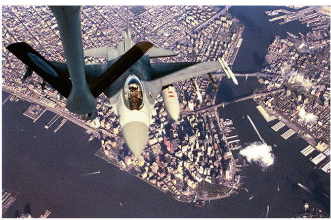
and earliest deployment was to Morón Air Air Refueling Wing prepares to deliver fuel to an F-16 Base, Spain. Security forces were in great Fighting Falcon from Vermont's 158th Fighter Wing. The ANG's commitment to maintain patrols over New York City on and after 9/11 was a group effort that showed the dedication and competence of the states' militias and the strategic reserves.

Both the medical clinic and commander's suite packed up their entire facilities from buildings number 15 and 16 and moved on base to a safe location following the attacks. Volunteers arrived and helped medical with the situation for a few days. Five days before October's drill the group finally moved back into their buildings off base. The command staff worked from the Independence Dining Hall for time and moved back off base to Building 16 in late October.