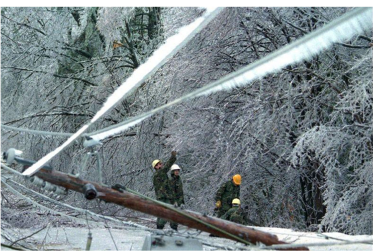
Unidentified members of the Air National Guard assist with downed wires and poles during the 1998 Ice Storm that devastated much of Northern New England.

The late 1990's saw the phenomenon of the internet become mainstream in American life. It was no different in the services. The digital age was here, and computers started to become more and more a part of everyday life for Airmen in a growing number