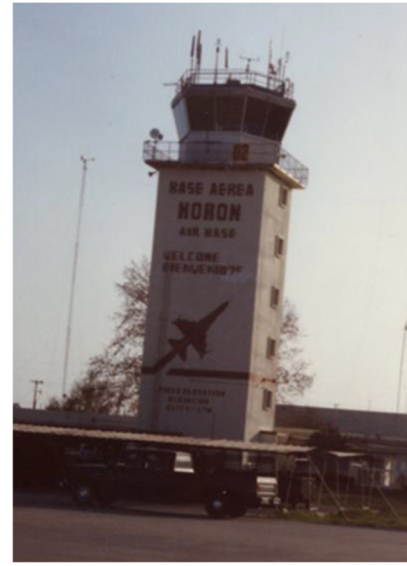
tracks as well The Air Traffic Control Tower as being just be- overwatches the airfield in Morlow the oceanic on Air Base, Spain.

continued present themselves and the New Hampshire unit was geographically and motivationally poised to meet the needs of the constantly evolving slate. said, That Pease's proximity to the Noble Eagle refueling