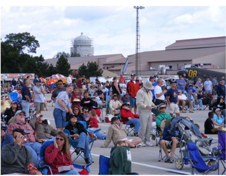
Some of the 100,000 patrons enjoy the Wings of Hope Airshow at Pease ANGB.

The Wings of Hope Airshow, as sponsored by the Brain Injury Foundation, was the first to be hosted at Pease in seven years. As part of the 60th anniversary of the Air Force and held during Air Force Week, it was two days of a ramp full of aircraft and flying demonstrations featuring an F-15 Eagle, P-40 Warhawk, L-39 Albatros, Rob Holland's aerial acrobatics, a B-2 Spirit stealth bomber, F-86 Sabre, the F-16 Fighting Falcons of the Viper East Demo Team, an F/A-18C Hornet demo flight, as well as a flyover of one of our own KC-135R Stratotankers!