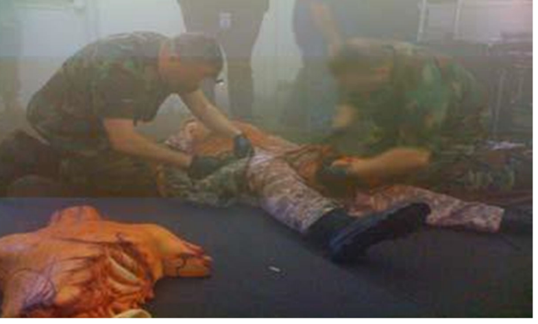
Airmen from the 157th Medical Group take part in a casualty response exercise while on a training mission to Hawaii.

checked off. The orthopedic clinic allowed medics to apply casts on each other and practice removing them with the circulating saw. When not able to demonstrate proficiency of tasks on real patients, members created impromptu in-services using equipment provided by the hospital. The physicians put their civilian specialty training and skills to work by performing patient care in the different hospital sections. The flight surgeons were able to take advantage of going on aerovac missions in which real patients were transported to other facilities. The aerovac missions also afforded our administrative staff the opportunity to work with the aerovac unit responsible for all the coordination that goes along with the mission. The exposure to the aerovac system was an invaluable training opportunity since it is rare that our folks get to experience that outside of going on a deployment. The nurses and