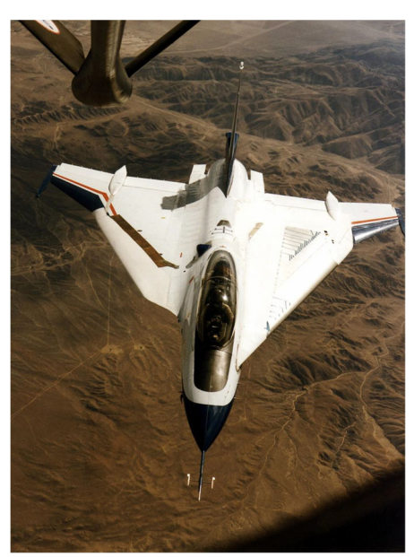
An F-16XL is refueled by a tanker from the 157th Air Refueling Wing during test operations.

Almost simultaneously with Exercise Cope Thunder, the airmen at Pease supported important research and development operations with General Dynamics, NASA, and the Ames-Dryden Flight Research Facility out of Edwards Air Force Base, California. The combined efforts helped hone the supersonic capabilities of the F-16XL aircraft by measuring performance with different wing gloves. The 157th's air refueling efforts allowed for more supersonic passes and accumulation of more data per flight than could have been achieved if forced to land after each