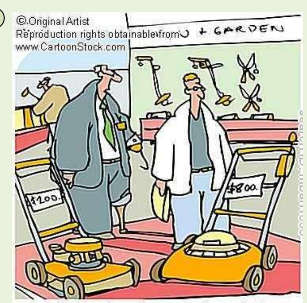
"If you ask me, that one's a better deal. It has more safety features."

Be Safe Out There -Your Risk Management Staff